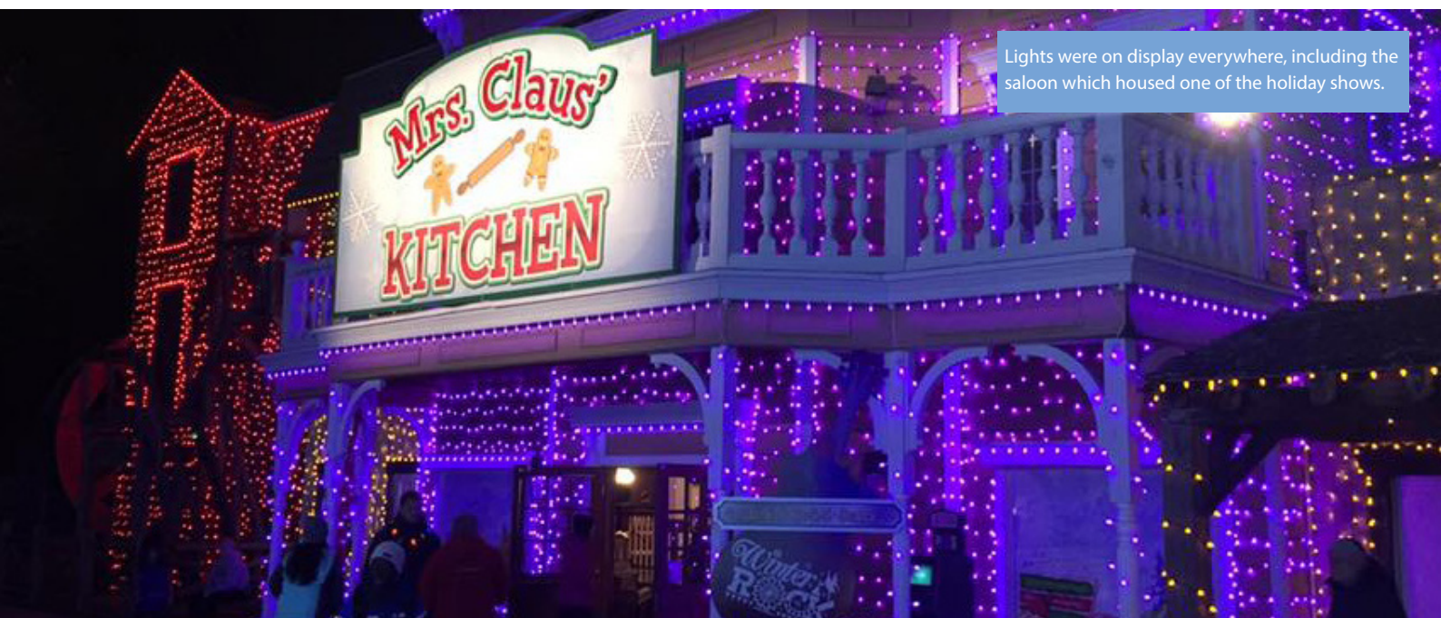
Lights were on display everywhere, including the saloon which housed one of the holiday shows.