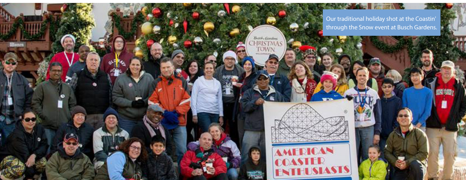
Our traditional holiday shot at the Coastin' through the Snow event at Busch Gardens.