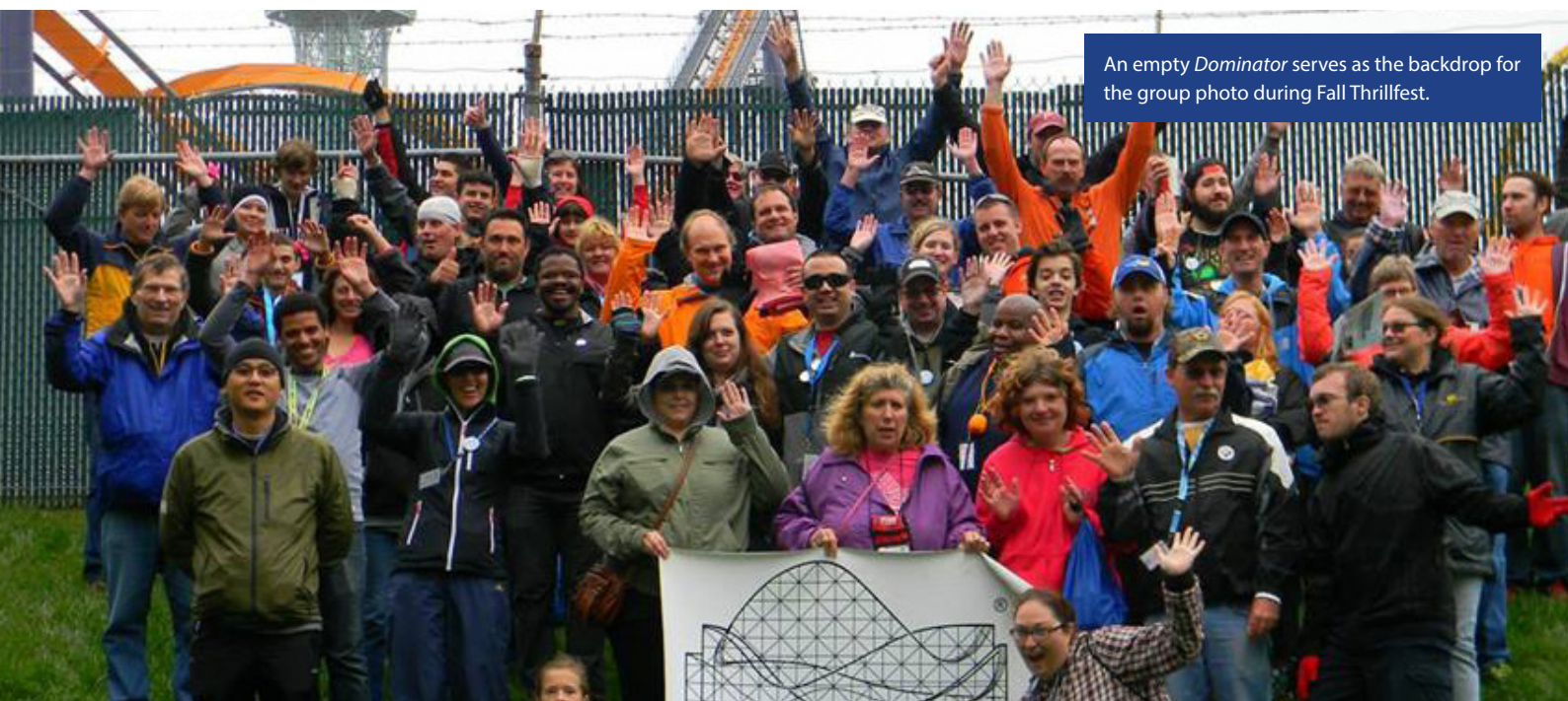
An empty Dominator serves as the backdrop for the group photo during Fall Thrillfest.